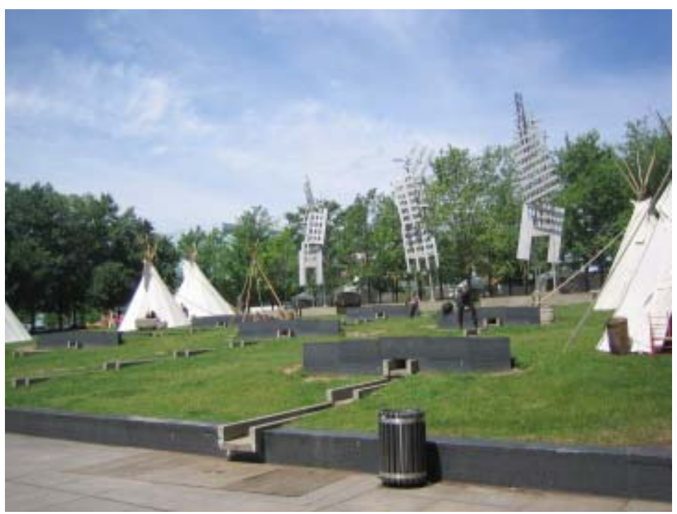
First Peoples' Festival

The art system is also supported by an intangible infrastructure. This includes art history, art canons, artistic vocabularies, critical discourse, networks, definitions and criteria of artistic merit and so called excellence.